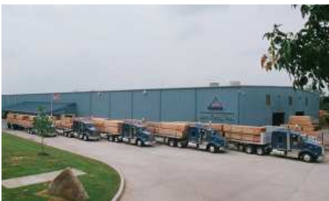
The John Rock Inc. fleet not only ships pallets to customers but also schedules and delivers raw materias to the plant.

He shared that pallet specifications have no