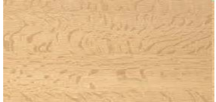
Appalachian White Oak Lumber

"As the central hardwood forest ages, poletimber size is simply not growing as fast," Luppold said. "White Oak and even Red Oak is not regenerating at the rate of other species and becoming a smaller portion of the forest resource."