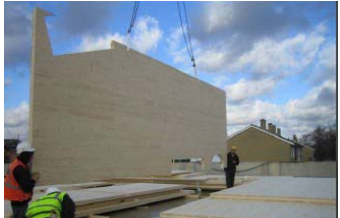
CLT panels erected at commercial site

As with any new product, Murphy said, there are obstacles to overcome. For CLT, it is acceptance into building codes, understanding of the potential uses, and attacks from concrete as steel industries that are threatened by its use.